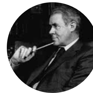
CYRUS R. VANCE