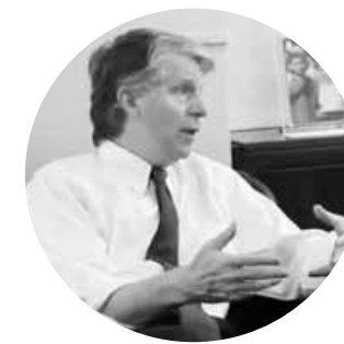
CYRUS R. VANCE JR.

WE PROUDLY TAKE OUR NAME FROM CYRUS R. VANCE – FORMER U.S. SECRETARY OF STATE, NEW YORK CITY BAR ASSOCIATION PRESIDENT, AND PROMINENT PRIVATE LAWYER – WHO EXEMPLIFIED IRONCLAD COMMITMENT TO FUNDAMENTAL RIGHTS THROUGH COLLABORATIVE PROBLEM SOLVING.