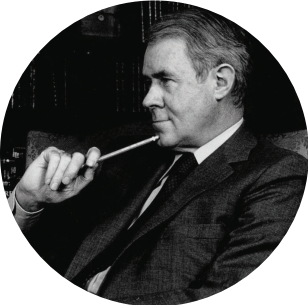
CYRUS R. VANCE